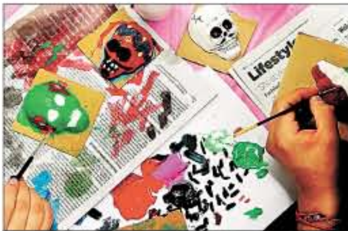
Sugar skulls are traditionally painted for the Día de los Muertos celebration. The skulls are used to decorate altars and honor the dead.

Espinoza was born in Montemorelos, Mexico, and moved to Texas when he was