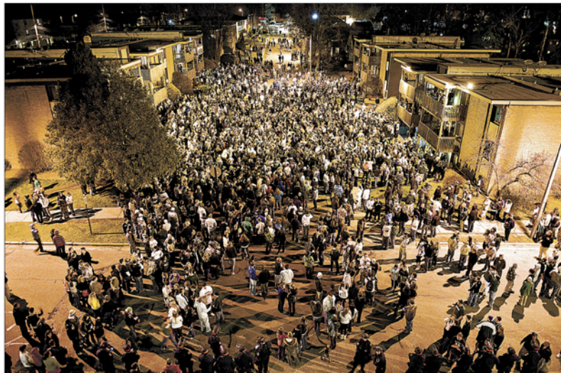
STATE NEWS PHOTO

Tear gas, 'Riot' declarations absent from Final Four celebrations; police point to shift in strategy since '05